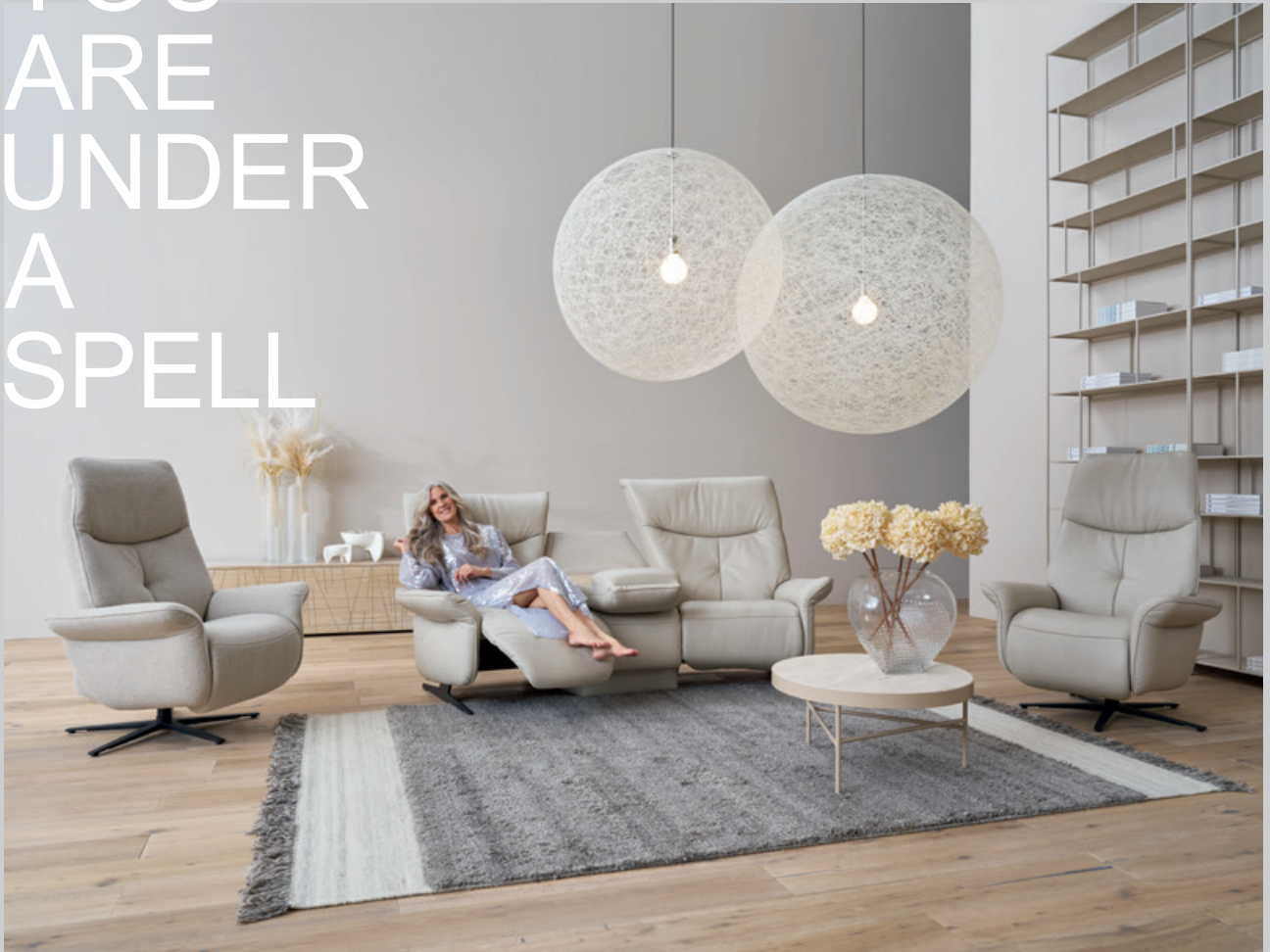
CUMULY COMFORT 4454 EASYSWING 7454