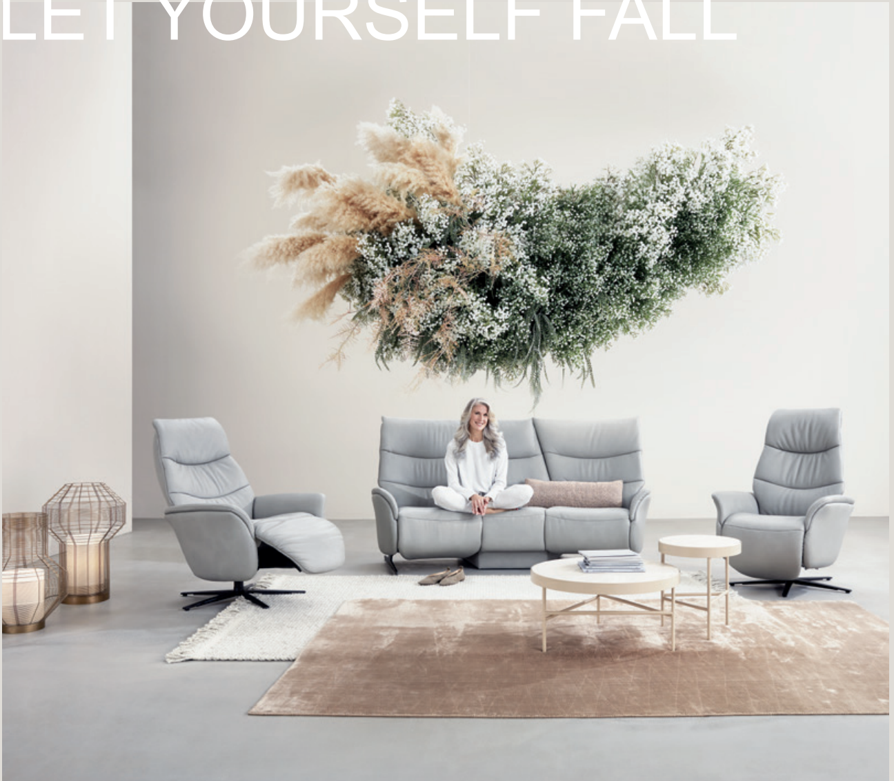
CUMULY COMFORT 4050 EASYSWING 7051

To achieve your personal experience to loose time and space, we strongly recommend a thorough reading of Aldous Huxley's novel Brave New World. In addition, CUMULY COMFORT 4050 can also be equipped with an electric lift-up aid function. The curved model has a fold-down central backrest that converts into a table in just a few easy steps. An external rechargeable battery, either in silver or anthracite, can be integrated into the upholstered set. To top it off, the sofa comes in 2 seat heights and 2 gradations of seating comfort. An optimal addition to CUMULY COMFORT sofa is the matching Easy-Swing armchair. Furthermore a wall-free version of the sofa set is available which can be ordered under model number 4051.