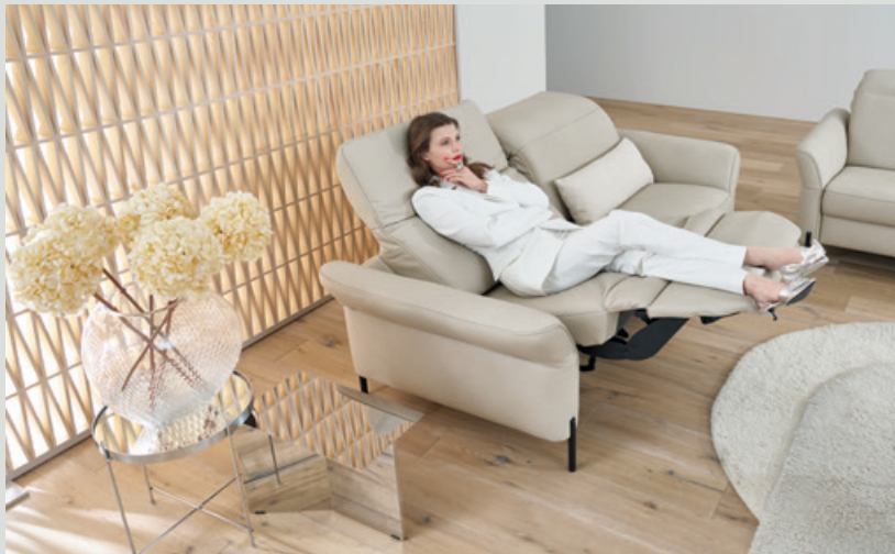
SPEKTRA 1485 CUMUREX CHAIR 7485