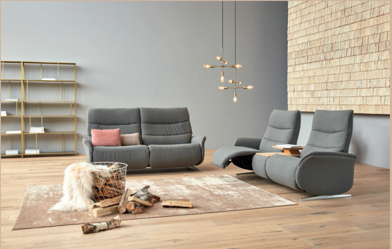
CUMULY COMFORT 4050 CUMULY COMFORT WALLFREE 4051

Come to rest, listen to the sound of silence, feel the rhythm of the heart, enjoy life. The wallfree reclining sofa himolla 4051 embodies outstanding seating comfort with numerous functions and high-quality materials. It can be adjusted electrically via a toggle switch on the side of the seat or manually into the reclining position. The headrest can also be adjusted electrically on request. In addition, the backrest, leg rest and headrest can be adjusted independently from each other. Particularly relaxing is the heart balance, where you recline the backrest and move the legs until they are at heart level. In addition, you can optionally adjust the seat tilt.