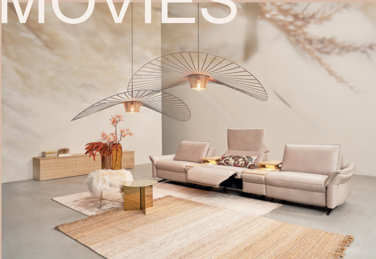
CINEMASOFA SPEKTRA 1178

CINEMASOFA SPEKTRA 1178 is really something. This sofa is developed and designed strictly to purpose. Basically any combination is possible. Any number pieces can be mounted together and a “indefinite” cinema seating is available. Tables in between as well as optional heart-balance functions enhances your personal cinema experience.