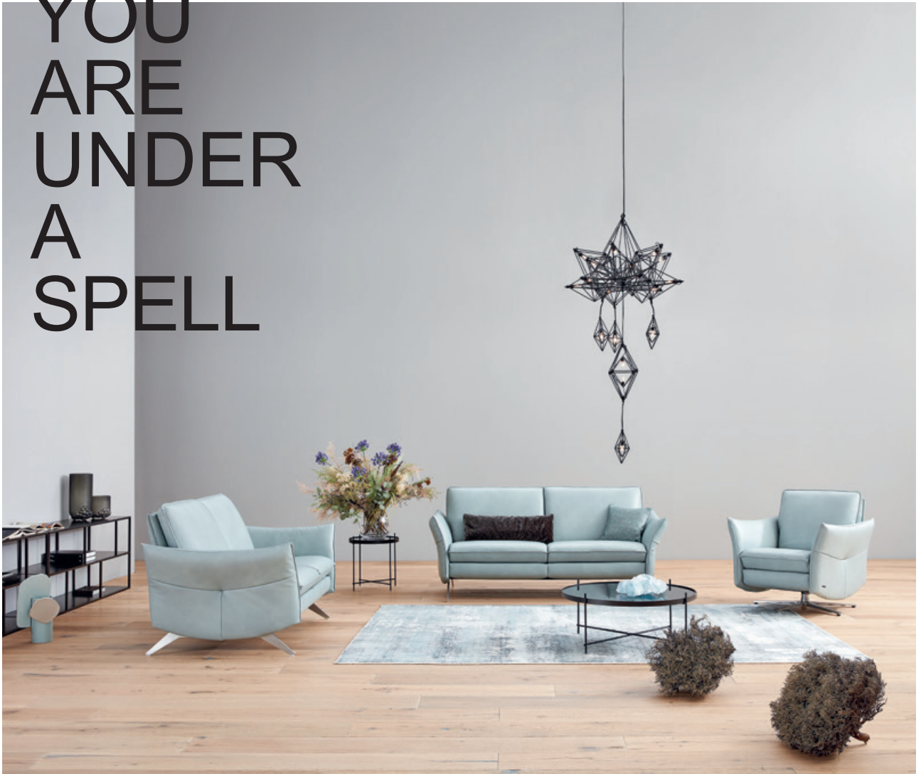
CUMUREX 6902 SOFA | CUMUREX 7916 ARMCHAIR

Model CUMUREX 6902 fascinates not only with its ultra-modern design, but especially with its technical sophistication. Probably the greatest achievement of this is the wonderful combination of a reclining function with a lift-up aid, which is hidden! This invisible function blends in into the overall appearance of the sofa suite. Thanks to the CUMUREX function, the relax position can be easily adjusted, whether electrically powered at the touch of a button or manually. Smooth and self-explanatory operation of the functions are characteristic unique features of himolla furniture. The fold-out headrests, stowable in the back when not in use, offer special visual highlights. In addition, the angle of inclination can be adjusted as required. Perfectly adapted to your very needs, the model is available in 3 different comfort levels and 3 seat heights. With this design innovation, new customer groups are addressed - younger, more style- and fashion-conscious people who do not want to compromise on healthy sitting, exclusive comfort and first-class design.