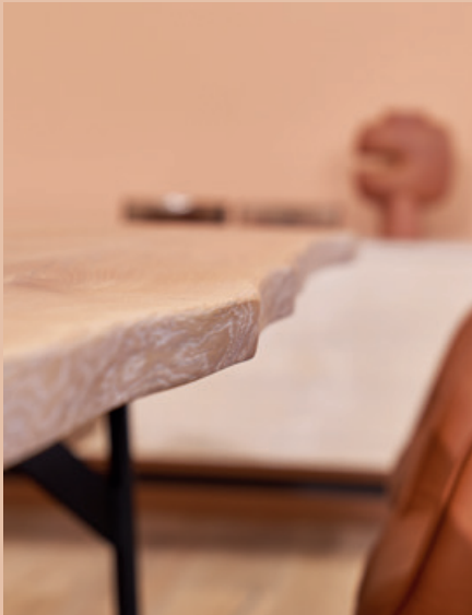
BENCH 1472 DINING CHAIR 1473 DINING TABLE 1474