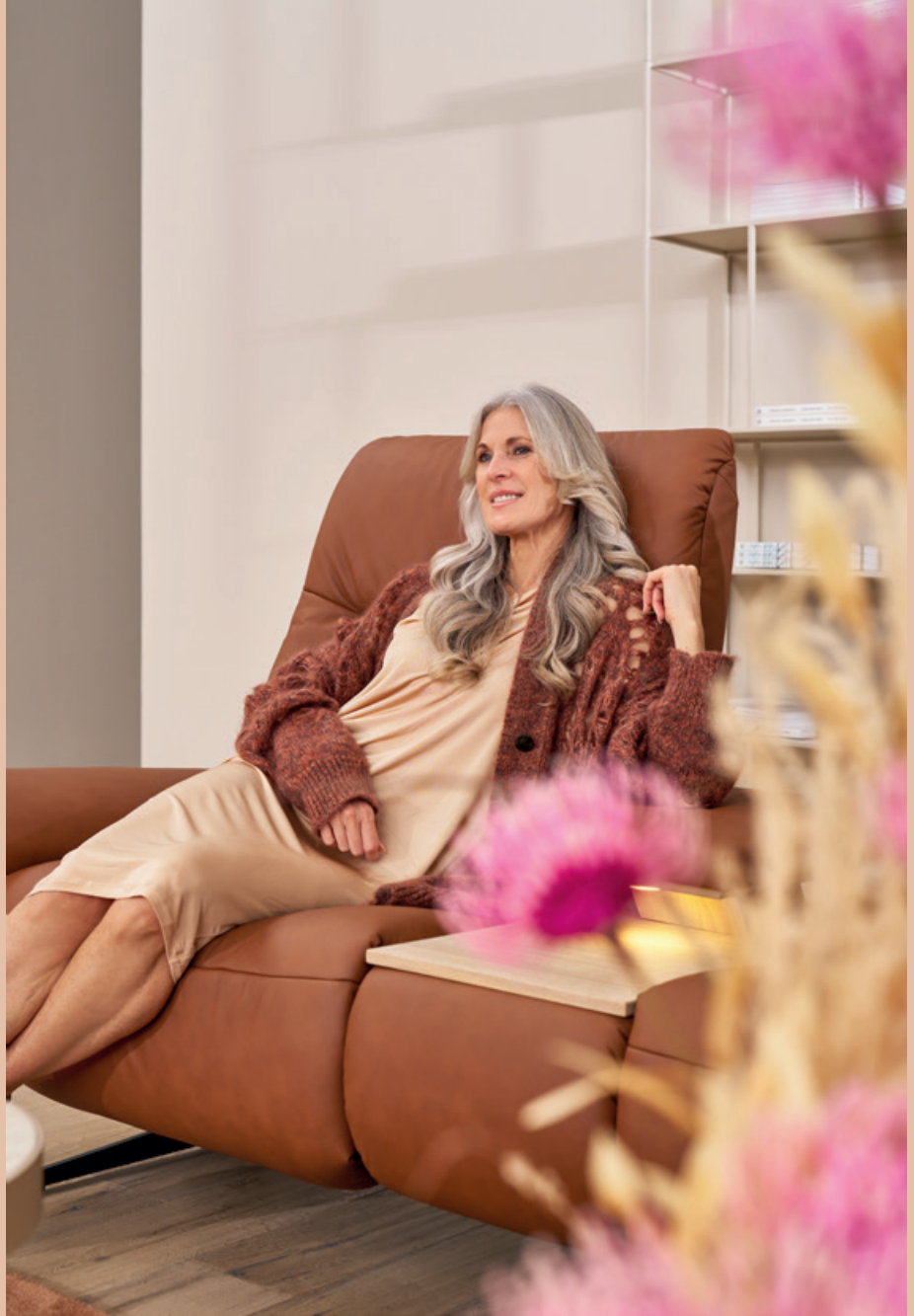
CUMULY COMFORT 4454 4455 EASYSWING 7454