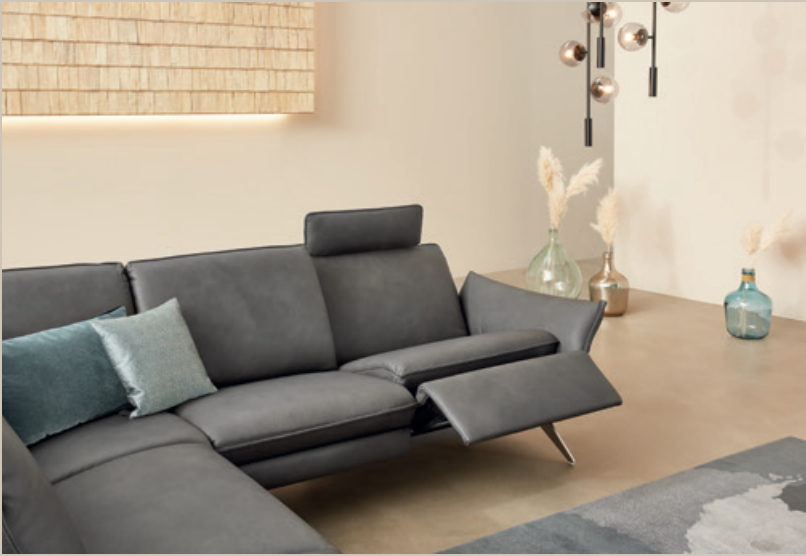
CUMUREX SOFA 6902