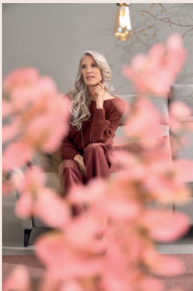
PLANOPOLY MOTION 4.0 SOFA MODEL 1926 ARMCHAIR CUMUREX 7916