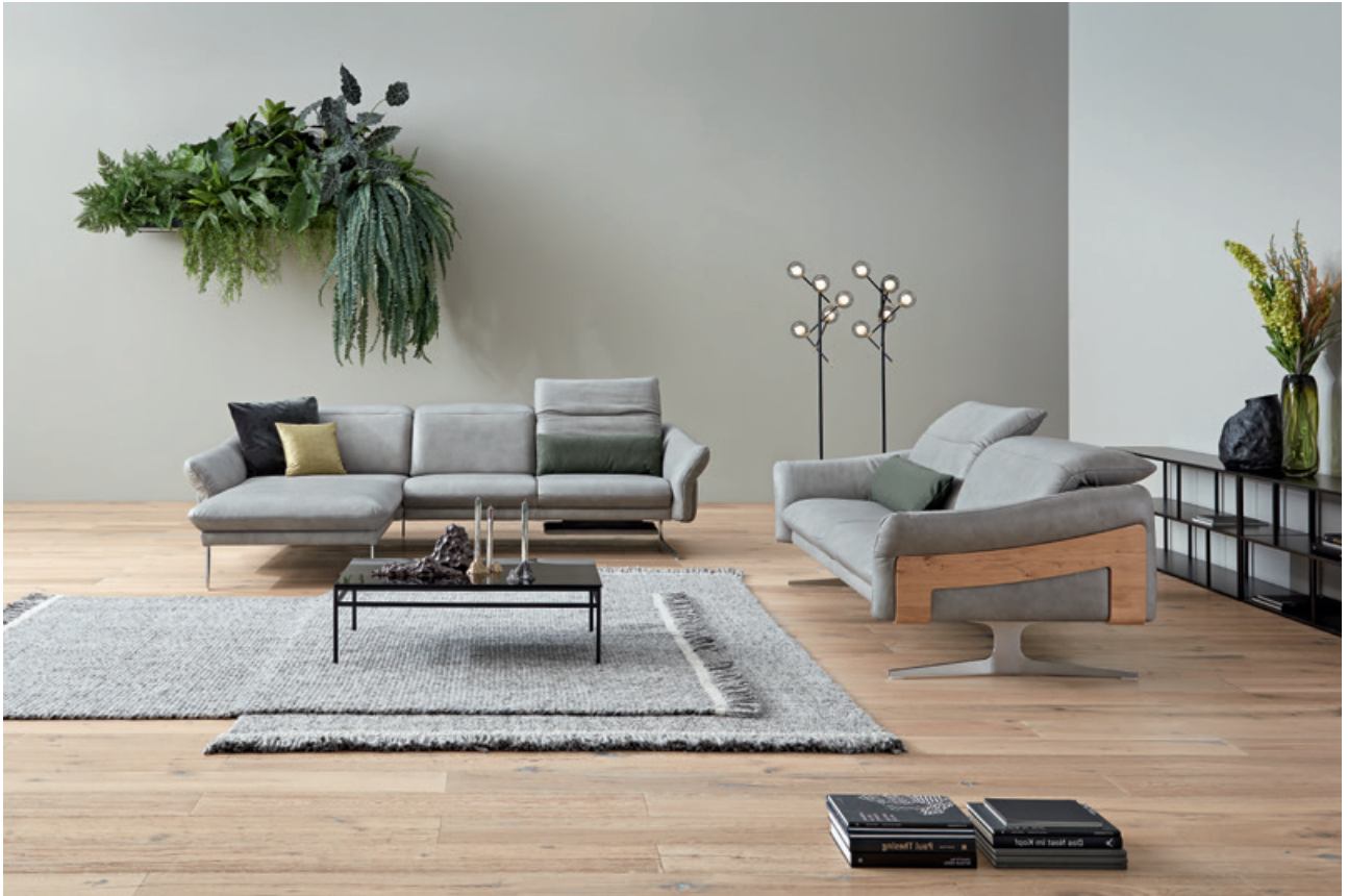
SOFA PROMOTION 1809 WITH WOOD APPLICATION SOFA PROMOTION 1808