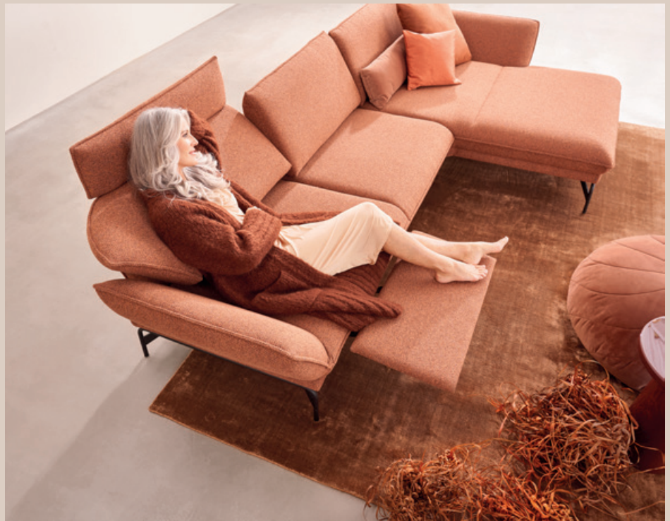
NOVA 1378 CHAIR 7190 7192

Whatever you do, do it gracefully! Like a sculpture in the room, NOVA stands gracefully on elegant legs, presenting itself as a delicate, light, “hovering” sofa range with a distinctive design statement. Yet, underneath lies innovative technology. The specially developed and patented high-tech recliner mechanism includes various manual rotation functions, allowing the sofa to easily transform into a large reclining surface. The side section becomes a leg rest, and the ottoman end reveals a practical resting surface. The backrest can be adjusted for inclination, and the headrest is flexibly attachable.